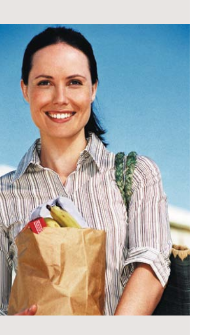
Once you purchase food, the safety of that food also becomes your responsibility.