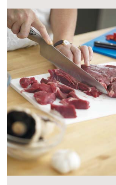
Use different clean utensils, cutting-boards and containers for different foods.