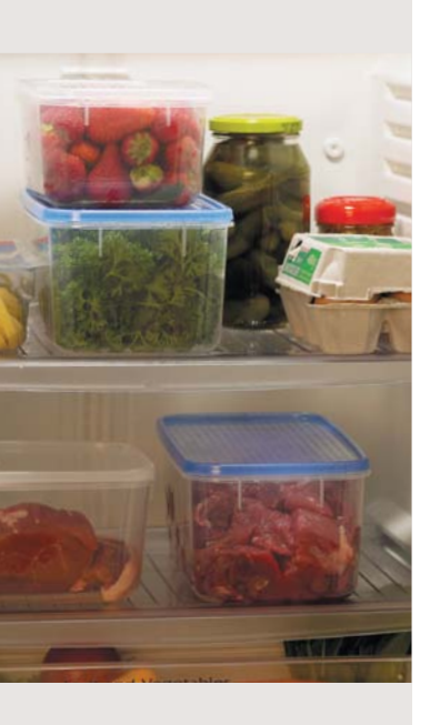
Use the fridge to thaw frozen food.