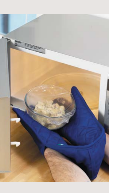
Reheat foods thoroughly so they are steaming (above 75°C) or boiling.