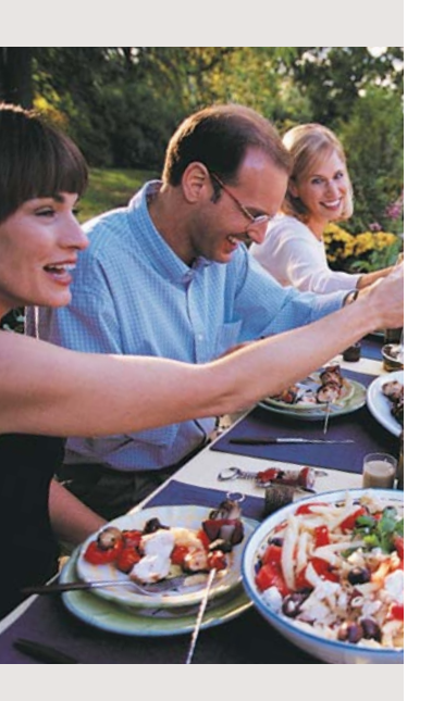
Take extra care when preparing, storing and handling food to eat away from home.